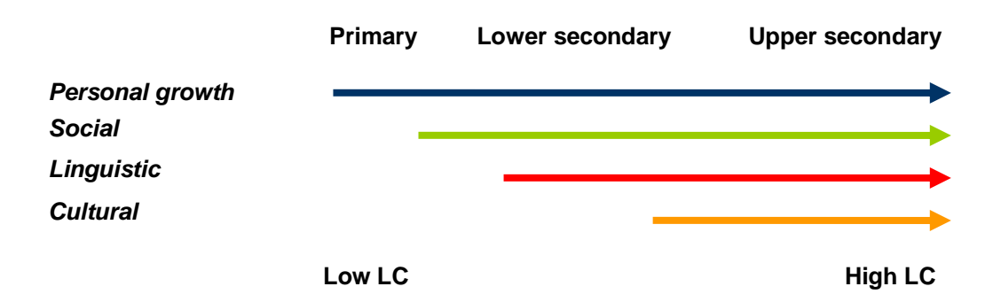
Figure 1: The cumulative paradigms of teaching literature in the literary framework

Our framework is based on the idea of the continuity and accumulation of paradigms, with shifting dominants, starting from a naive dependent reader (low literary competence) who can become, at the end of the road, a sophisticated autonomous reader (high literary competence). The sense of this developmental model is presented in Figure 1.